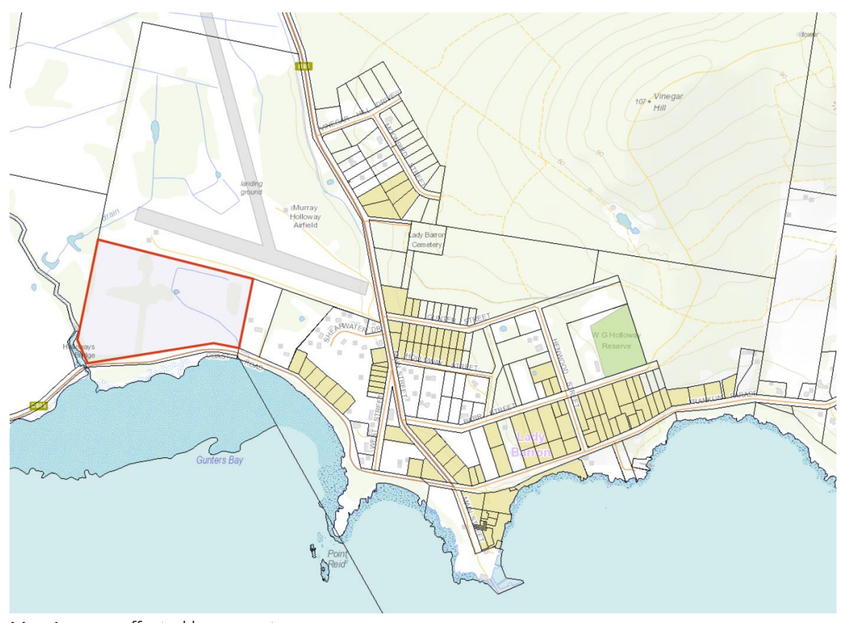
Map 1 – area affected by request